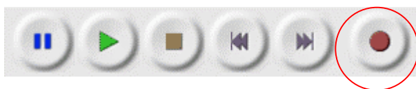
Figure 11.1 Record button

To begin recording press the Record button