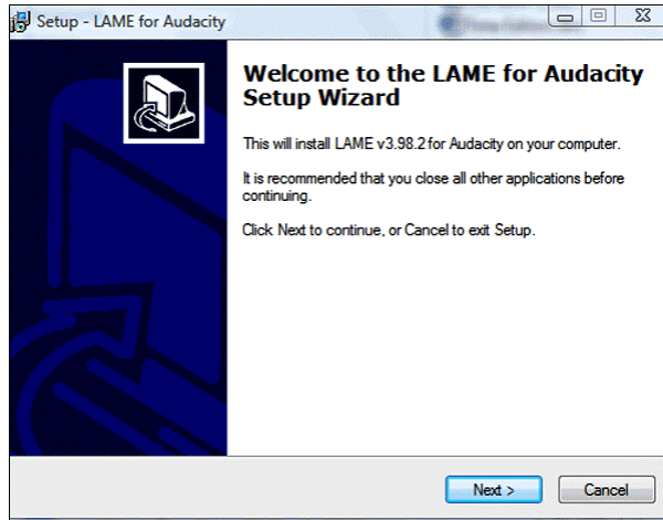
Figure 4.2 LAME setup wizard

The Setup-LAME for Audacity welcome page dialog box will open. Follow the onscreen instructions: