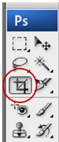
Figure 4.1 Crop tool

When you have opened your image in Photoshop CS3 press the letter C to get the crop tool. Alternatively, select the crop tool directly from the Toolbox as shown in figure 4.1