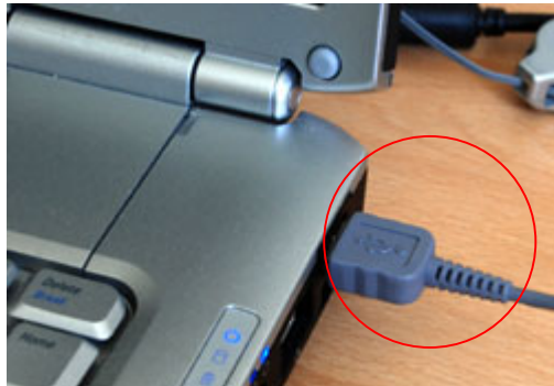
Figure 5.2 USB cable connected to computer.

Plug the other end of the USB cable into one of the ports on your computer. There are usually a few ports on your computer but use the port that is easily reached.