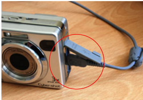
Figure 5.1 USB cable connected to camera.

Plug one end of the USB cable into your camera. The USB port on your camera is usually smaller that the USB ports on your computer.